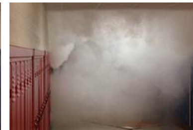
A Revolutionary Solution